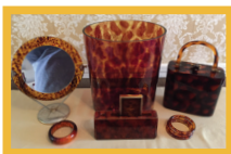
Vintage Jewelry & Vanity Items