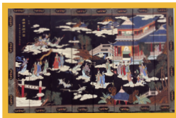
Asian Divider Screen