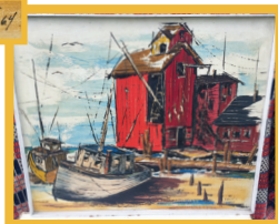
R. Huberdault Painting

WEDNESDAY, AUGUST 9 - 6:00 PM (PREVIEW 3:00 - 6:00 PM)