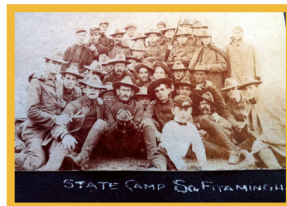
Spanish War Photos

SATURDAY, APRIL 26 - 6:00 PM (PREVIEW 3:00 - 6:00 PM)