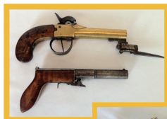
Rare Pistols: Belgian Percussion w/ Bayonet & Gibbs, Tiffany & Co. underhammer