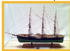
Handmade Ship Model