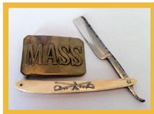
1880s Bone-handled Razor & MASS Belt Buckle