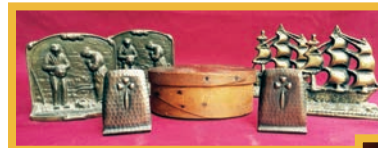
Vintage Bookends (Roycroft, Etc.), Primitive Pantry Box