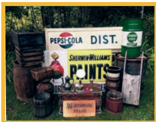
Signs, Primitives & More

POLISH AMERICAN CLUB 46 So. MAIN ST., SOUTH DEERFIELD, MA 01373 WEDNESDAY, OCT. 5 - 6:00 PM (PREVIEW 3:00 - 6:00 PM)