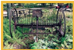
Antique Hay Rake