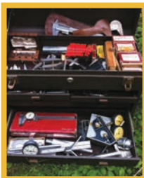
Machinist & Other Tools