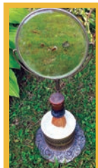
Shaving Mirror & Brush