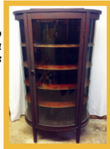
Curio & China Cabinets

LOCATION: POLISH AMERICAN CLUB • 46 SO. MAIN ST. • SO. DEERFIELD, MA 01373 413.559.9565 • MORE INFO / VIEW PHOTOS: www.catamountauctions.com Or visit www.auctionzip.com and search "Catamount" in auctioneer directory.