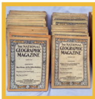
National Geographic Magazines

TUESDAY, MAY 3 - 6:00 PM (PREVIEW 3:00 - 6:00 PM)