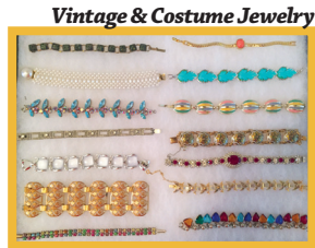
Vintage & Costume Jewelry

TUESDAY, MAY 3 - 6:00 PM (PREVIEW 3:00 - 6:00 PM)