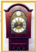
Tempus Fugit Clock